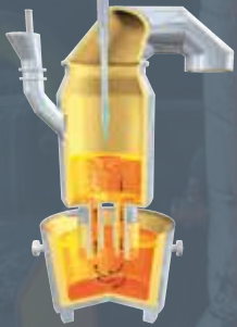
RH Vacuum Circulation