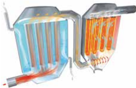
Typical Cooler / Filter combination