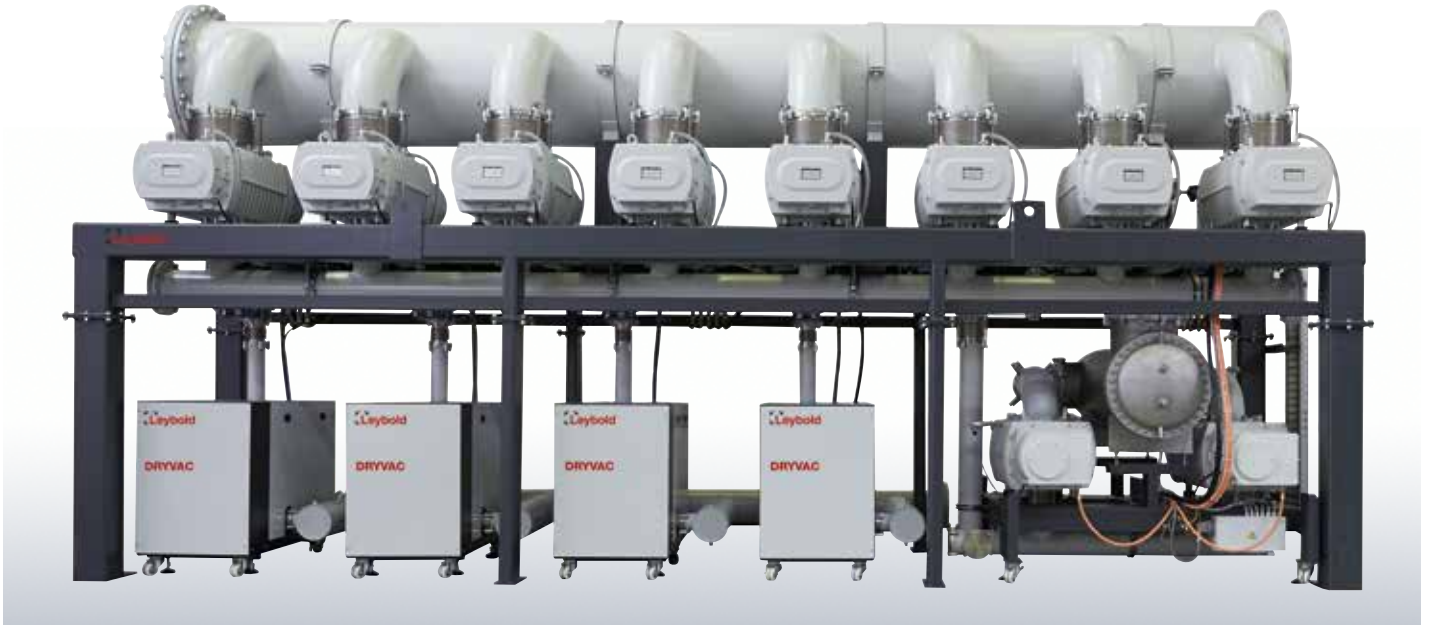
8-2-4 system configuration (ATEX)