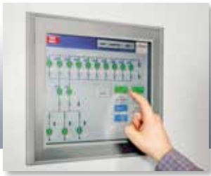
Process-adapted control system