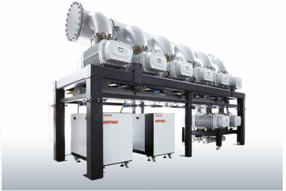
6-2-2 system configuration

Mechanical vacuum systems are practicable, reliable and powerful tools for efficient operation of steel degassers.