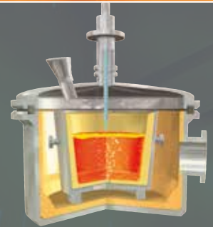
VOD Vacuum Oxygen Decarburization