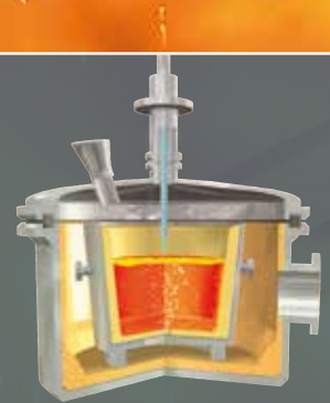
VOD Vacuum Oxygen Decarburization